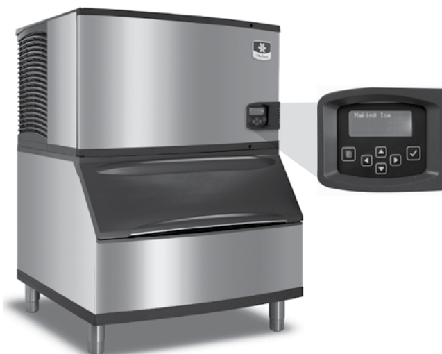
Indigo Series i-300 Ice Machine on B-170 Bin

Designed for operators who know that ice is critical to their business, the Indigo™ Series ice machine's preventative diagnostics continually monitor itself for reliable ice production. Improvements in cleanability and programmability make your ice machine easy to own and less expensive to operate.