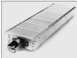
Equipped with gas fired pre-mixed atmospheric infra-red burner