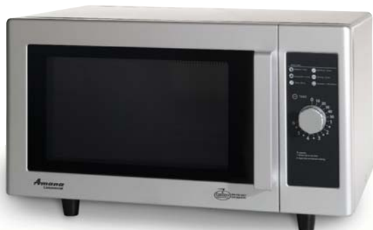
Model RMS10D shown