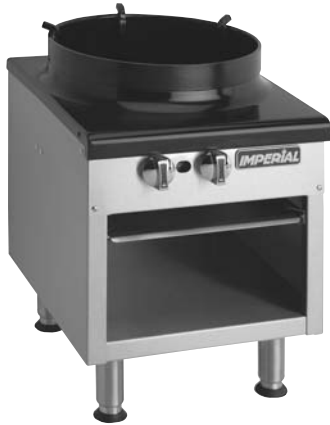
Tempura Wok Range Model ISP-18-W