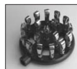
Anti-clogging 18-Tip Jet Burner