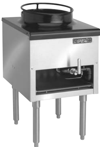
Mandarin Wok Range Model ISP-J-W-13