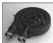
3-Ring Burner. Standard burner with two adjustable valves.