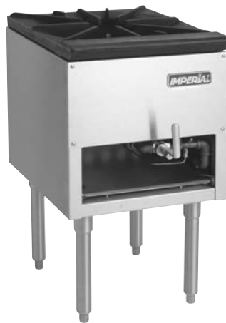
Hi-Temp Stock Pot Ranges Model ISP-J-SP