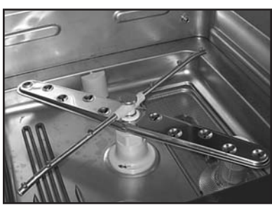
Upper and lower wash and rinse arms guarantee excellent results.