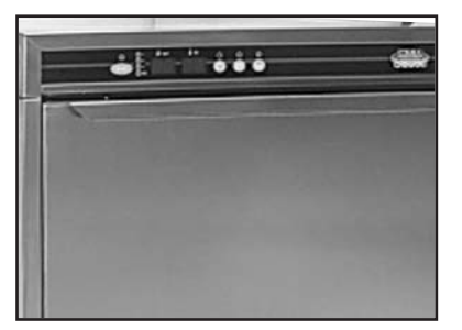
Top mounted controls are easy to read and simple to operate.