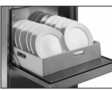
Large 13-3/4" door clearance accommodates oversized plates, glasses and utensils.