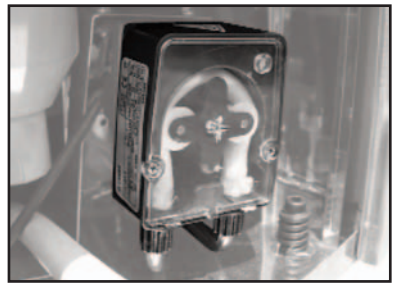
Built-in detergent and rinse chemical pumps.